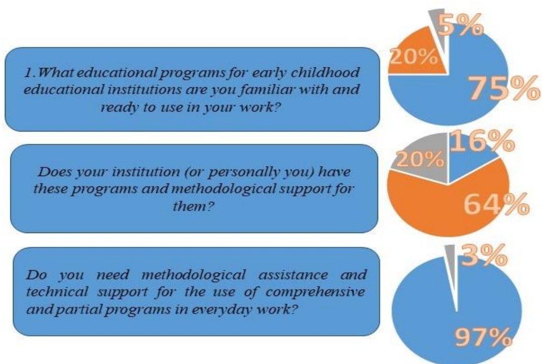
Fig. 2. Results of the survey of early childhood teachers

Only 16% of early childhood teachers up to 30 years old answered yes to the second question. 64% of teachers admitted that they did not understand the question and had never heard of it. 20% refused to give a direct answer (Fig. 2.).